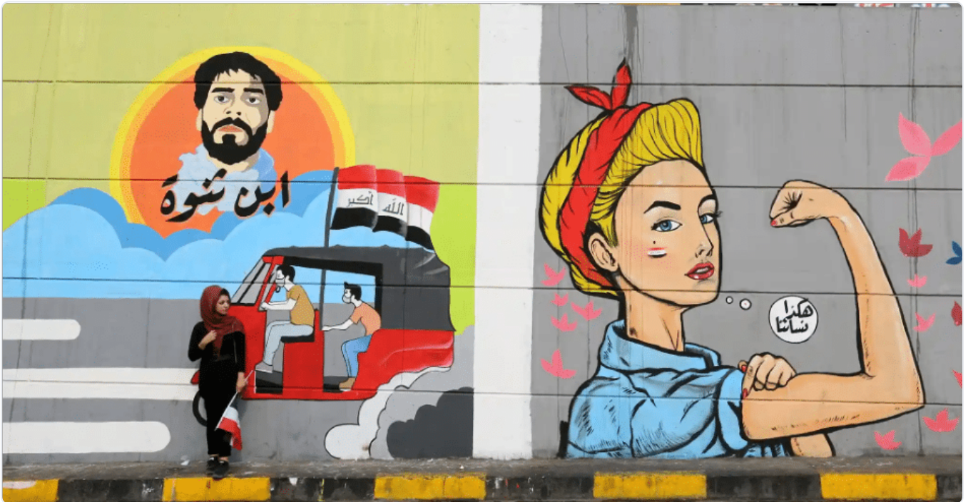
Figure 1. The message next to the woman’s arm on the right says: “Our women are like this.” The words under the face of the man on the left say: “Son of Thanwa.” This phrase refers to Safaa al-Saray, an influential October Revolution protestor who was killed by a gas canister shot by the security forces. Women were crucial to efforts aimed at defying the social norm of attaching the name of the father to the name of an offspring. Safaa al-Saray’s friends, however, defied the norm and referred to him as Ibn Thanwa (Tanwa’s son), after his mother.

Women challenged traditions also by participating in protests and making it acceptable behavior in Iraqi society. Their dedication even led men to encourage women to spearhead the demonstrations. To counter those who attempted to silence women by using words such as flaw or فروع ( awrah , which translates to “nakedness”), slogans such as “Your voice is not a flaw; it is a revolution” became popular among Iraqi women. In Arab cultures across the Middle East and North Africa region, the word awrah is used to shame or disparage others.