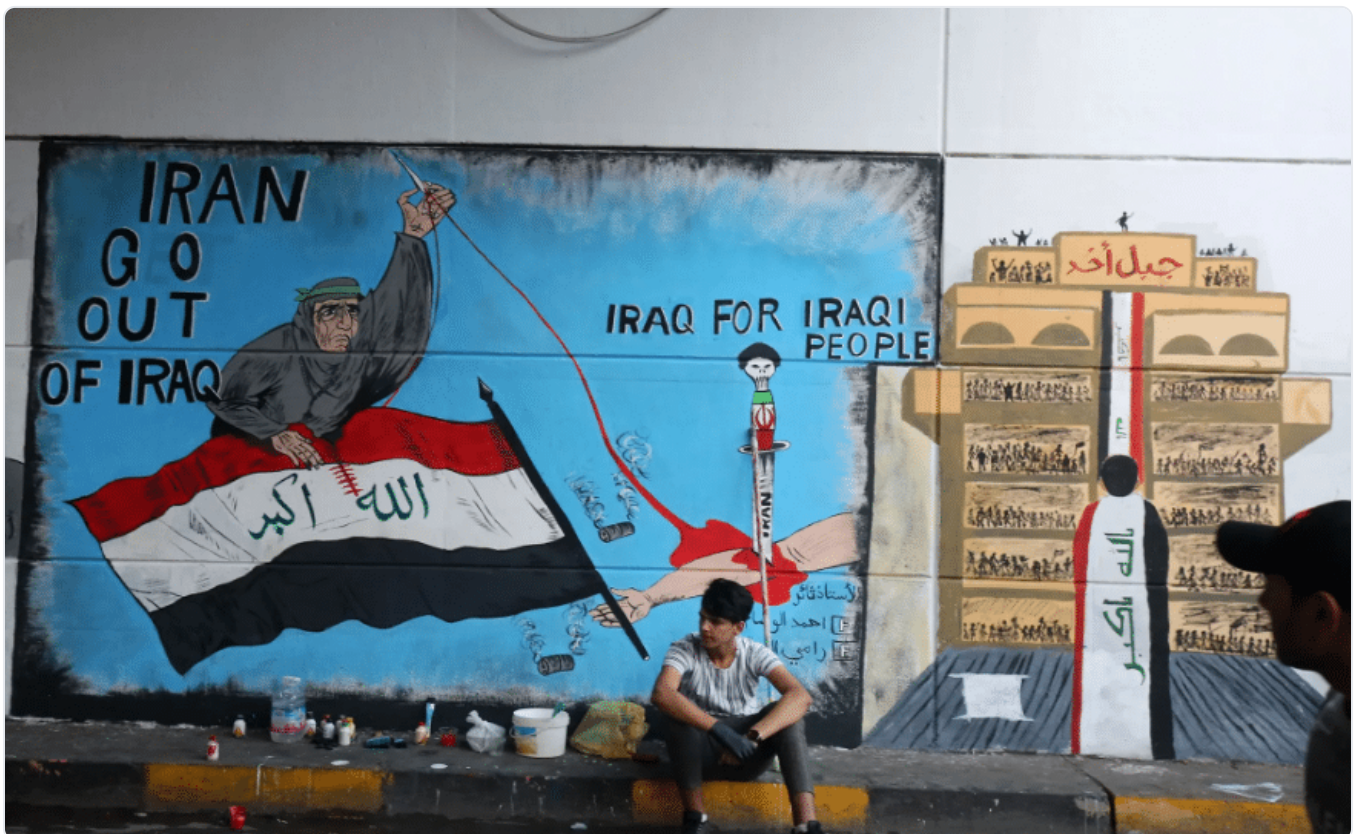
Figure 2. A protestor rests in front of a political mural titled “The new generation.”

Iranian security groups to kidnap, torture, and assassinate protesters. Furthermore, the Iranian militias stormed the US Embassy in Baghdad on December 30, 2019, which prompted the US to kill Quds Force Commander Qassem Soleimani and Abu Mehdi al-Muhandis. The Iranian-backed militias and the US airstrike on Iranian leadership in Baghdad infuriated the population further, as they had long faced foreign interference in their nation (see Figure 2).